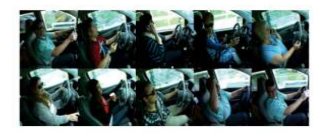
FIGURE 15. Example cases in which AWGD correctly classifies driving patterns but ResNet cannot do