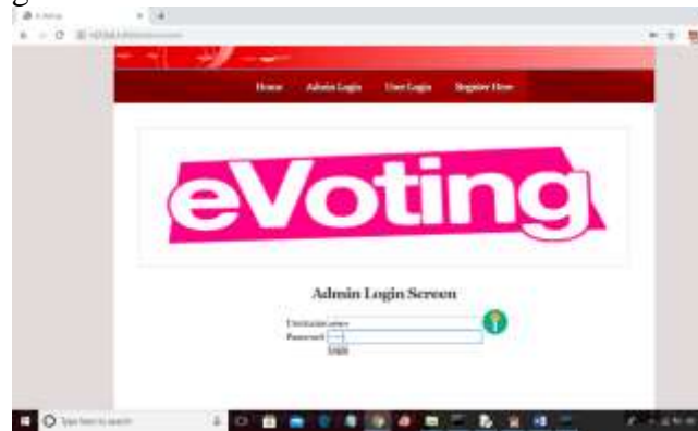
In above screen login as admin and after login will get below screen

In above screen if same user try again then will get message as 'You already casted you vote' and now logout and login as 'admin' to get vote count