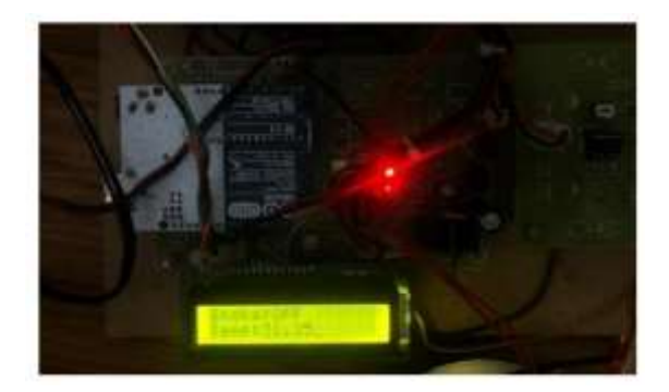
FIG 4 OUTPUT OF STAGE I RESULT

In stage 1 in this project, it contains of gases sensor which is used to find any harmful gases near the child and it equipped by temperature sensor which is used to find temperature near the child. Those gases and temperature are displayed on the display. By the stage 1 we are ensuring that the child is in safe place or not.