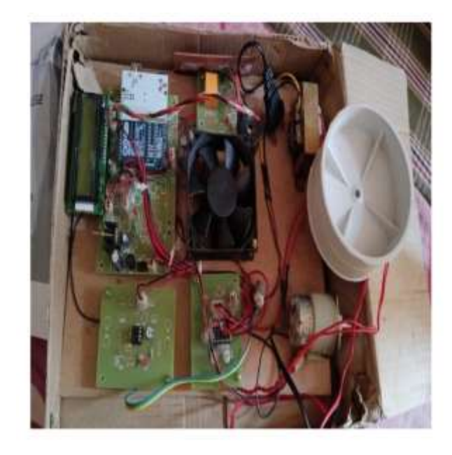
Fig 3 Final position of hardware kit

• The sensors which are used in this project are sensitive