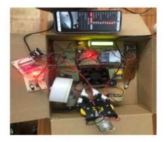
FIG 5 OUTPUT OF STAGE II RESULT