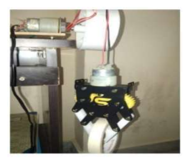
FIG 6 OBJECT PICK UP WITH HELP OF GRIPPER

In stage 2 clipper is attached to the kit which performs the activity of pick and place which is used to pick the child from hole and it contains of camera, by this we get the visuals of the child and their condition.