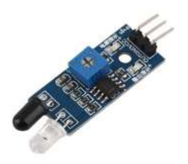
Fig 1. IR detector