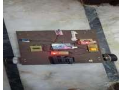
Fig 6: Result