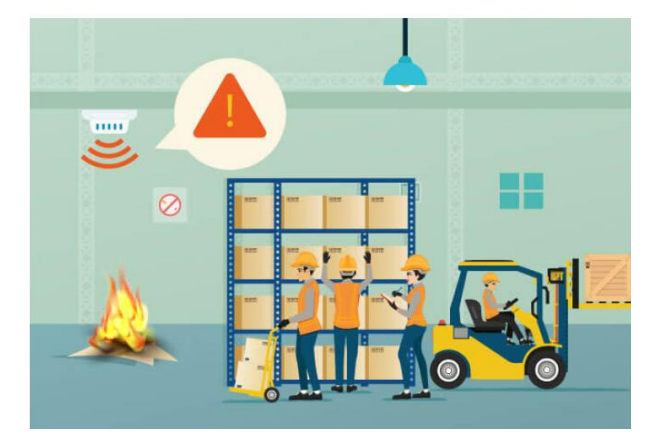
Fig: Fire alert in Industries

capable of real-time monitoring. This network not only enables the early detection of potential fire hazards but also facilitates a swift and targeted response to mitigate risks