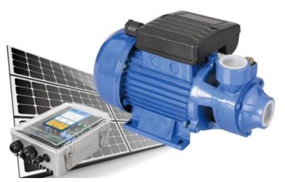
FIG 4: DC MOTOR

The DC motor in solar bikes is responsible for converting electrical energy from the battery into mechanical energy that powers the bike. It works by using the principle of electromagnetic induction.