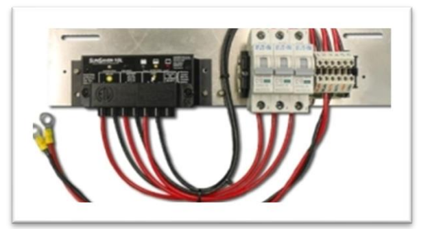
FIG 5: CONTROLLER

The controllers on a solar bike plays a crucial role in managing the flow of electrical energy. They regulate the power coming from the solar panels and the battery, ensuring that the system operates efficiently.