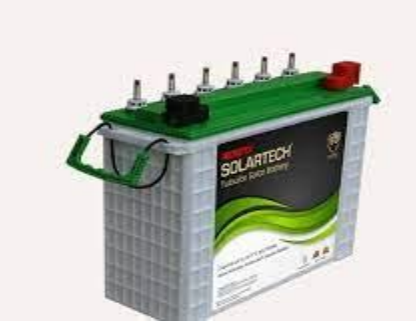
FIG 3: DC BATTERY

ISSN2454-9940 www.ijsem.org Vol 18, Issue.2 April 2024