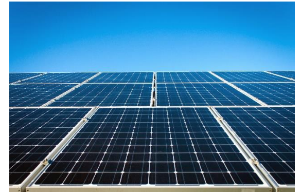
Fig 2: SOLAR PANEL

Solar panels work by harnessing the power of sunlight and converting it into usable electrical energy. The panels are made up of photovoltaic cells, which are typically made from silicon, when sunlight hits these cells, it excites the electrons within them, creating an electric current.