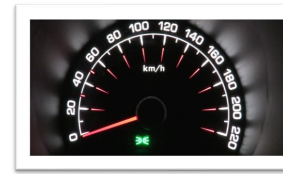
FIG 7: SPEEDOMETER

The speedometer on a bike measures the speed at which you're travelling. It works by utilizing a sensor that detects the rotation of the bike's wheels. As the wheels turn, the sensor sends signals to the speedometer, which then calculate the speed based on the frequency of those signals.