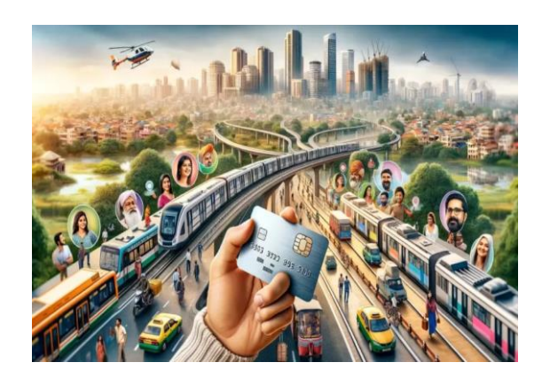
Figure 1.1 Over view of the Smart Travel Card

This seamless integration not only enhances the efficiency of the travel process but also contributes to reducing congestion and transit delays.