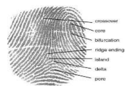
Fig 1.2.2: Fingerprint Analysis