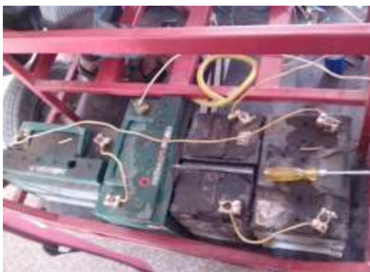
Fig.5 Battery Bank