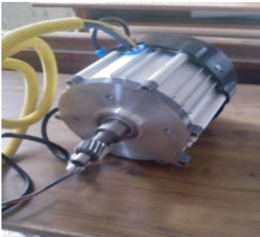
Fig.4 BLDC Motor

batteries run the motor which drives the wheel of the vehicle. The vehicle which we have made as our project uses a belt pulley mechanism in which the shaft of the motor is connected through the belt pulley system. The power supplied to the batteries is from the solar panels which are giving a total output of 400W and they are then used for charging the batteries. The batteries which we are using are lead acid batteries which are of 48V rating each of 12V. The motor's rating is of 48V which gets charged through the four 12V batteries. The belt used in our project is a timing belt which has teeth that fit into a matching toothed pulley. When correctly tensioned, they have no slippage, run at constant speed, and are often used to transfer direct motion for indexing or timing purposes. They are often used in lieu of chains or gears, so there is less noise and a lubrication bath is not necessary. Timing belts need the least tension of all belts, and are among the most efficient. We have laid emphasis on the economical part so that it can be used to cover short distances without consuming energy from external sources and at the same time keep the environment pollution free.