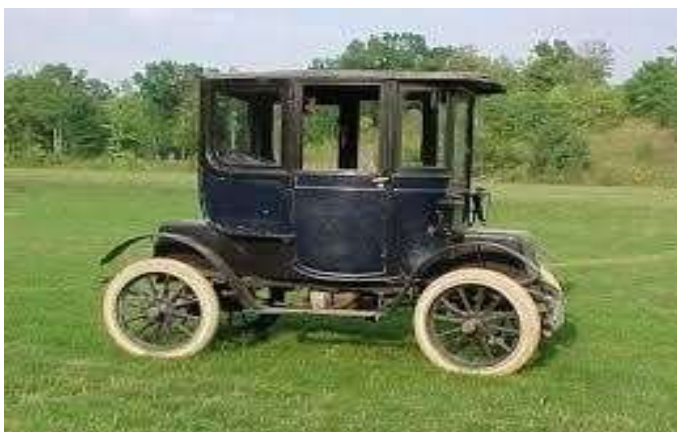
Fig.1 First solar car

Due to the unique nature of the solar community and events, these technologies remain an untapped resource. Significant improvements and understanding of electric vehicles has been developed that can be applied to a broader range of automobiles to provide more efficient and cleaner alternatives over combustion engine vehicles.