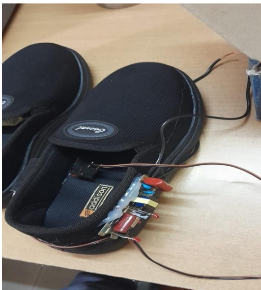
Figure 2. Designed prototype of the smart