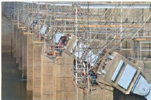
Figure No. 2 External Post Tensioning to restore or increase capacity