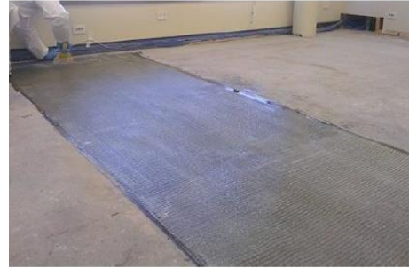
Figure No. 4 FRP Composite Strengthening services Concrete solutions