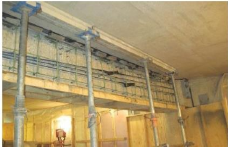
Figure No. 1 External Post Tensioning

gravity. Induced tensile stresses usually exceed pressure and reinforcement to provide the necessary strength and ductility, must be added.