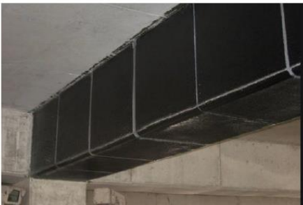
Figure No. 3 Carbon FRP fiber installation

Composite wraps or carbon fiber jackets are used for reinforcing and adding ductility to reinforced concrete and maceration components without any penetration. Composite wraps on reinforced concrete columns are most effective. Additional containment provided.