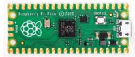
Raspberry Pi PICO board

It is built around the RP2040 Soc , a very fast yet cost-effective microcontroller chip packed with a dual-core ARM Cortex-M0+ processor . M0+ is one of the most power-efficient ARM processor Raspberry Pi PICO board