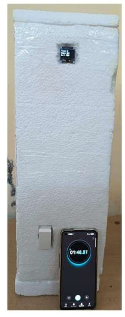
Cold container reaching 6-8 degrees in 2mins