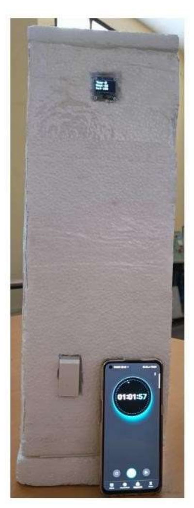
Cold container reaching 0 degrees in 1hr

It has been tested successfully to maintain temperatures within the range of 0 degrees to 8 degrees. The portable design and reduced power consumption address previous limitations, while the Arduinobased system offers control flexibility and customization different options for of applications and the addition extra or components as required. Also sensors the cold container reaches in between 6 to 8 degrees in 1min and takes 1hr approx. to reach 0 degrees Celsius.