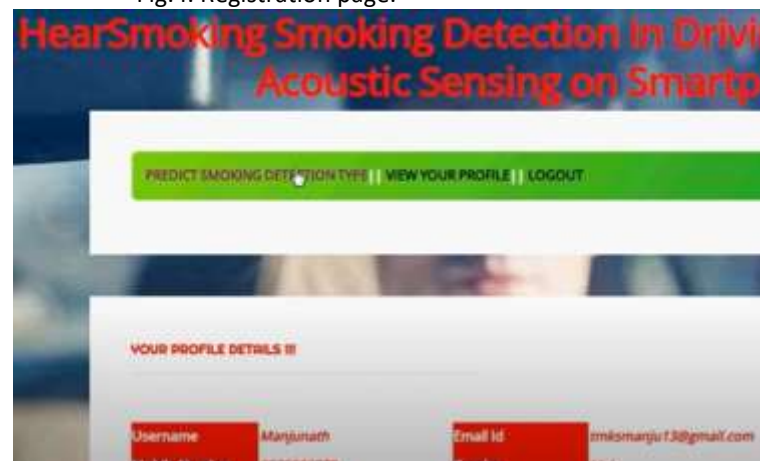
Fig.5. Prediction of smoking.