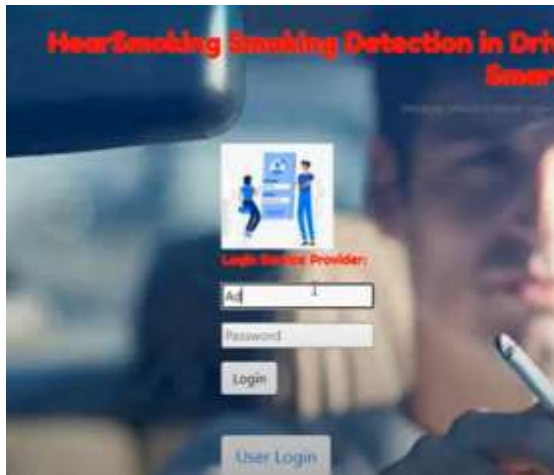
Fig.1. Home page.

operations like REGISTER AND LOGIN, PREDICT SMOKING DETECTION TYPE, VIEW YOUR PROFILE.