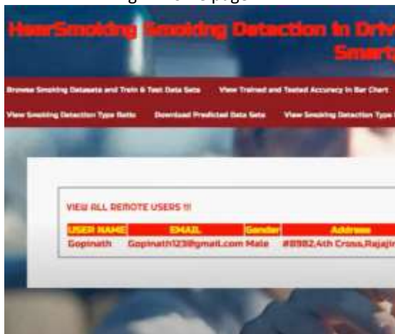
Fig.2. Users data display