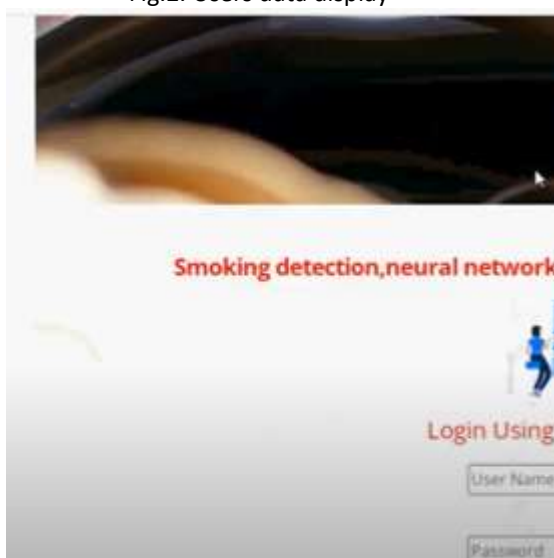
Fig.3. login account