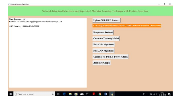
Fig 7. Results screenshot 7

In above screen we can see with SVM we got 84.73% accuracy, now click on 'Run ANN Algorithm' to calculate ANN accuracy.