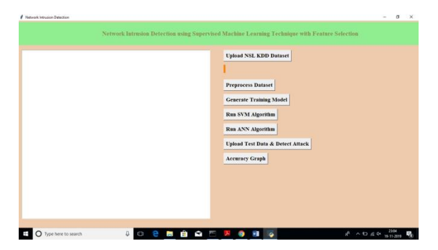
Fig 1. Results screenshot 1

Moreover, the comparative analysis conducted in this study provides valuable insights into the relative performance of different machine learning models for network intrusion detection. By benchmarking the proposed ANN-based model against existing techniques in the literature, it was demonstrated that the novel supervised machine learning system developed in this study outperformed other existing models with respect to intrusion detection success rate. This suggests that the combination of ANNbased machine learning with wrapper feature selection represents a promising approach for enhancing the effectiveness of intrusion detection systems and improving their ability to detect and respond to evolving cyber threats. These results underscore the importance of continuous research and development efforts in the field of machine learning for network security, as well as the need for ongoing evaluation and refinement of intrusion detection techniques to address emerging threats in cyberspace effectively.