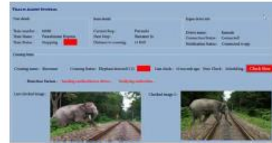
Figure 1. Object detection in the track.

The Capturing process is done through camera which was in railway tracks [6]. The railway images were added into the database file with creature in the track and without creature in the track. Both the images were compared and detection of object took place [7]. The images stored in the database file in Train application includes Clear railway track image, and obstacle detected image. The elephant and car images were used as input images. Two images of elephant were present for recapturing process also which is shown in figure 1.