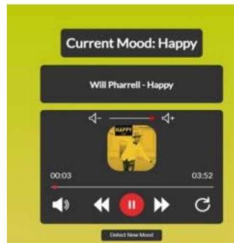
Fig.2. Happy mood detected.