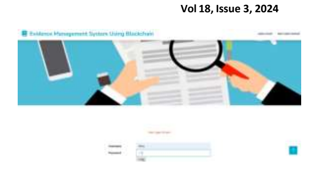
Fig 9 User Login Screen