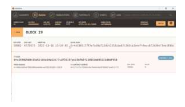
Fig 15 Ganache Screen