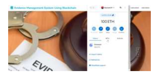
Fig 16 Metamask Screen