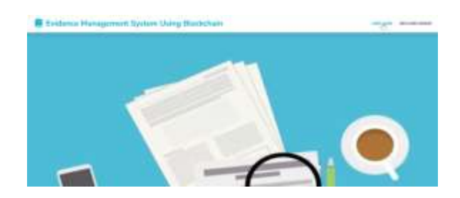
Fig 8 Click on User Login