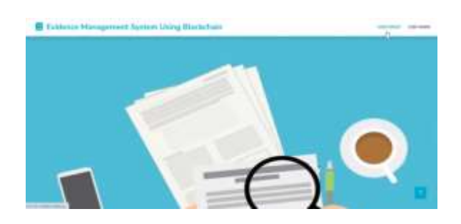
Fig 2 Home Page