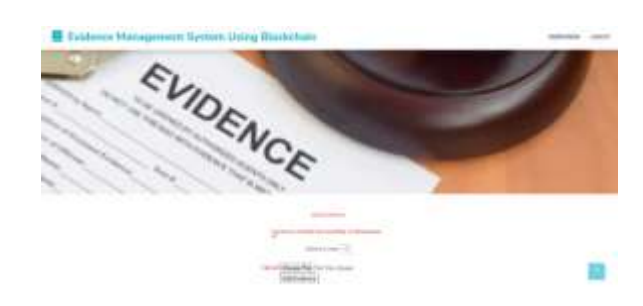
Fig 12 Evidence Added Successfully