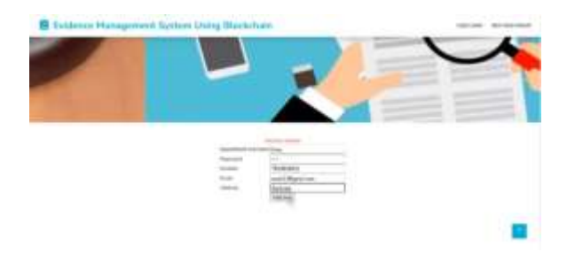
Fig 3 Signup Page