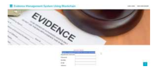
Fig 7 Output Screen