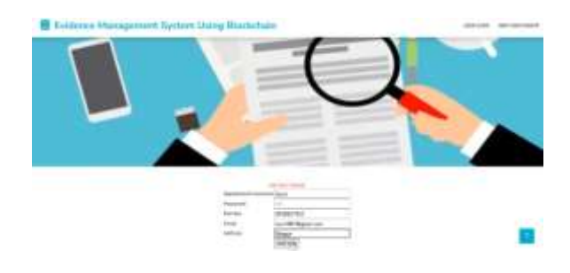
Fig 6 New User Signup Screen