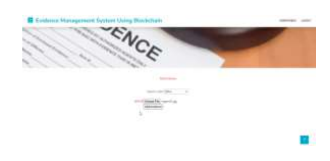
Fig 11 Add Evidence Screen