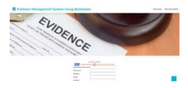
Fig 4 Output Screen