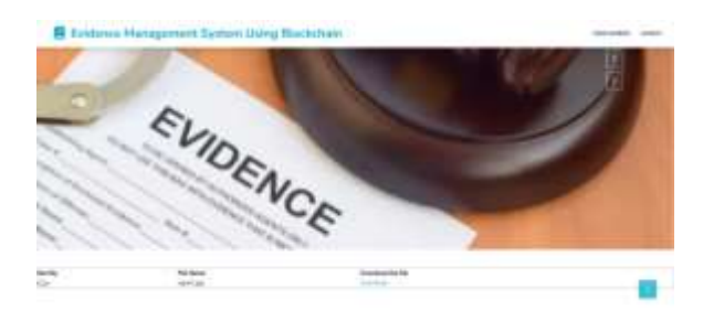
Fig 14 Output Screen