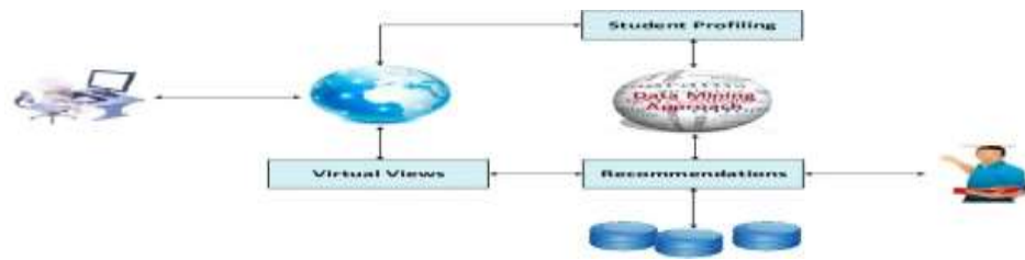
Figure 3: Personalized E-learning Architecture. Source [17]

The integration of cloud technology and e-learning has received more attention from the institutions due to its high demand to continue education. Almost all the institutions of schooling deemed it to be an operative and suitable alternative for e-Learning. Nevertheless, an absence of research may provide a theoretical foundation from which a methodology could be constructed.