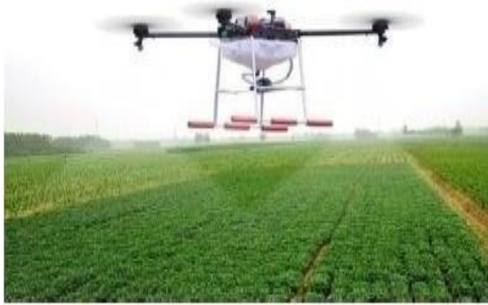
Fig 2: Pesticide spraying mechanism

Munmun Ghosal et al [5] developed a tracking system where air pollution is detected by a GPS module to determine longitude and latitude. This system monitors data using various sensors such as temperature sensor (LM35), humidity sensor (AM1001), MQ6 smoke, MQ135 CO 2 , LDRlight intensity, and GPS L80 for location tracking and Arduino board control. Factors considered are smoke, CO 2 , temperature, light intensity and humidity. The air quality indicator is monitored and displayed on a web server using an Apache server to determine the location where the contamination is noticeable and can be managed before a dangerous situation arises. It is a low cost and a more efficient model, therefore, can be concluded which can be used to monitor the spirit of small application.