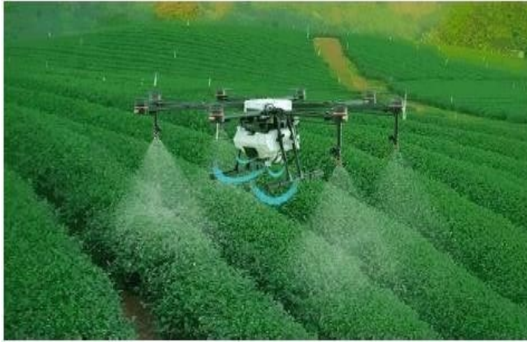
Fig 1. Crop monitoring using UAV

In the current year crop health monitoring is an important role in the agricultural sector. Diseases can be detected by UAV mounted on camera (Uncontrolled Air Vehicle). The UAV controlled by Transmitter Channel contains mode1 and mode 2. Crops should be monitored intelligently using the improve plant growth in fertilizer spray and pesticides based on crop damage.