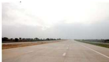
Fig.2. A view of rigid pavement.

Rigid pavements are those possess noteworthy flexural strength. The stresses are not transferred from grain to the lower layers as in case of flexible pavement layers. The rigid pavements are made of Portland cement concrete—either plain, reinforced or prestressed concrete. The plain cement concrete slabs are expected to take up to about 40 kg/cm 2 flexural stress. The rigid pavement has the slab action and is capable of transmitting the wheel load stresses through a wide area below Figs 2 and 3.