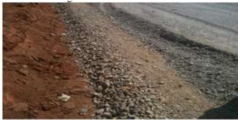
Fig.1. A view of Flexible pavement components.